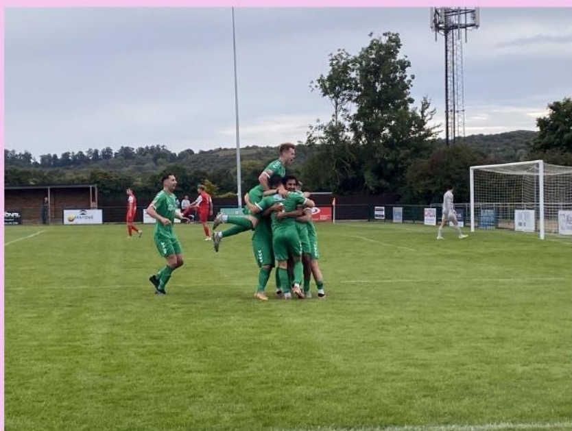
EXCITING ADVENTURE | The Biggleswade FC players celebrate