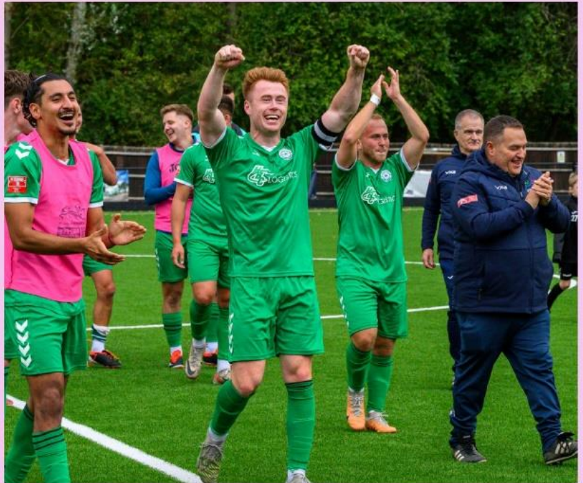
CUP OF CHEER | Celebrations after winning in the previous round

“Short term, we want to continue doing everything we currently do well and both broaden and deepen this. On the pitch, we want to consolidate our position at Step 4 and see more of our young players’ progress through to the first-team and